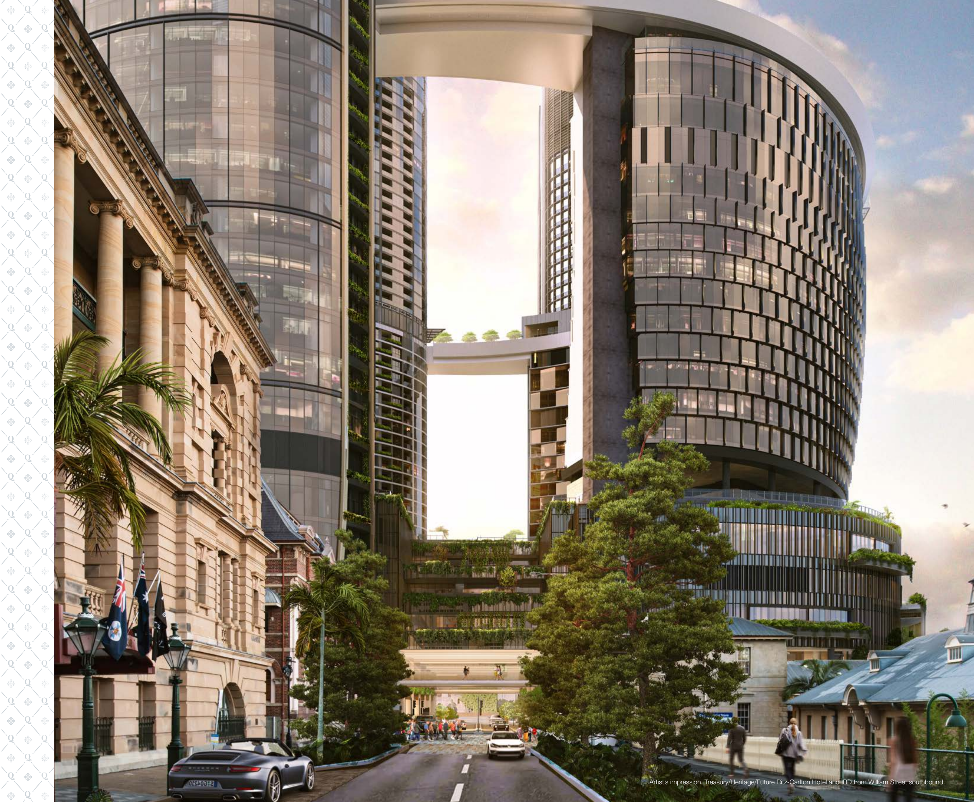
Artist's impression. Treasury/Heritage/Future Ritz-Carlton Hotel and IRD from William Street southbound.

Centred on a large collection of beautifully restored heritage buildings, the stunning modern development will take its own place in history, becoming a famous landmark for Brisbane around the world.