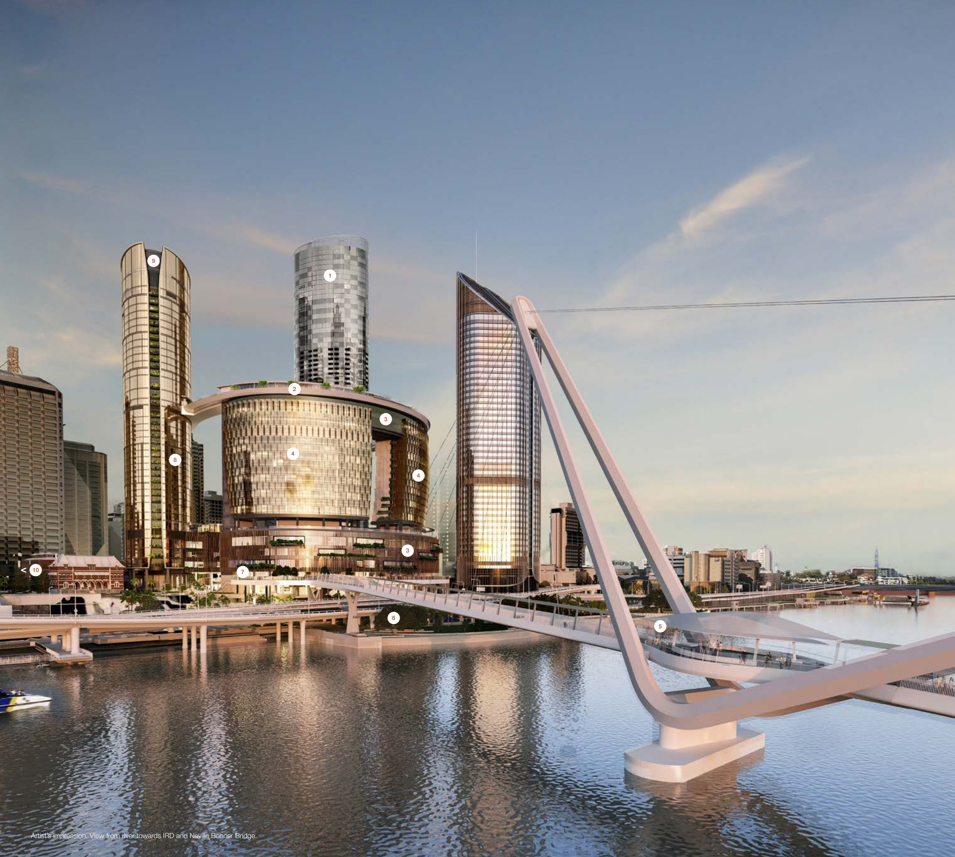
Artist's impression. View from river towards IRD and Neville Bonner Bridge.