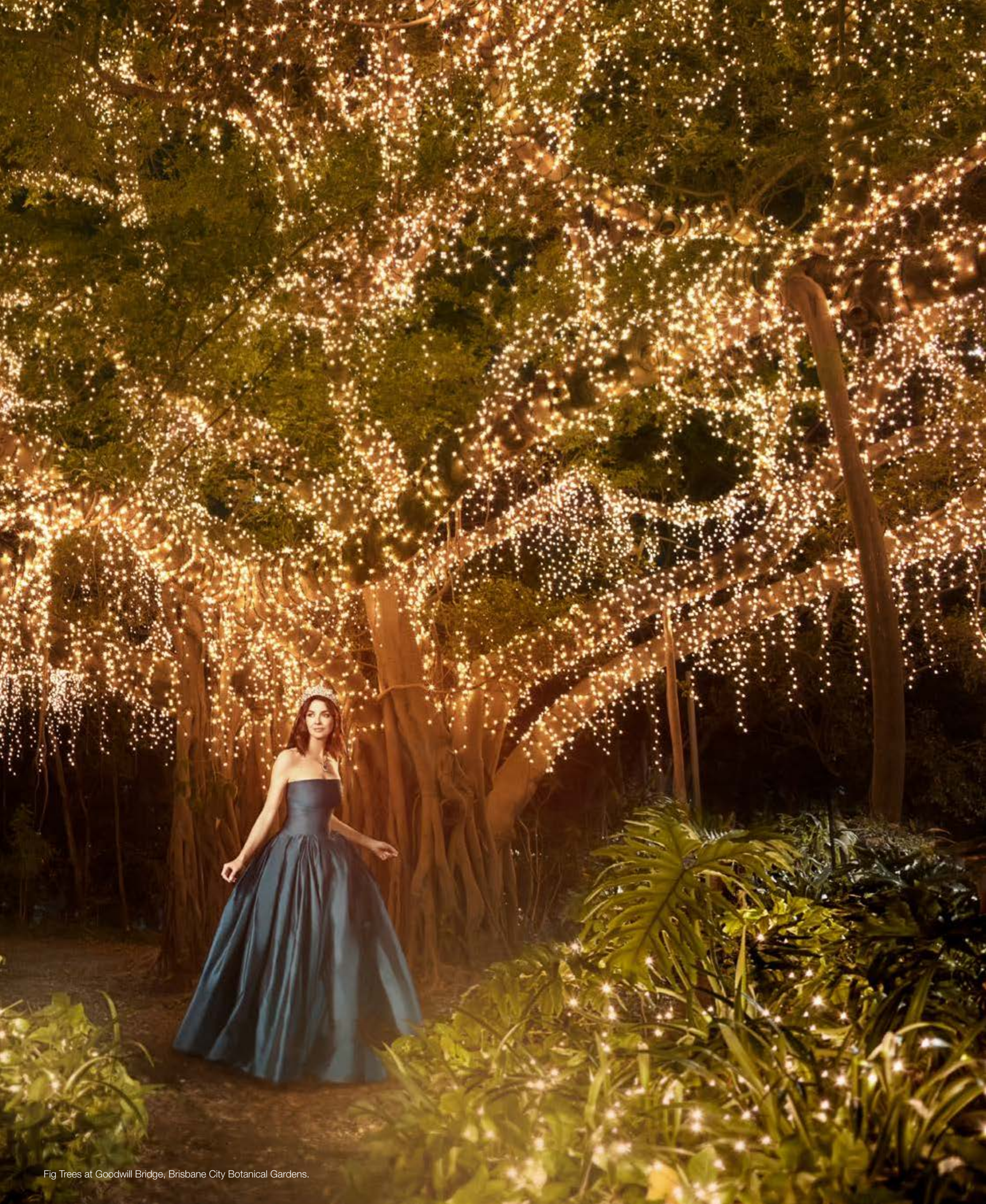
Fig Trees at Goodwill Bridge, Brisbane City Botanical Gardens.