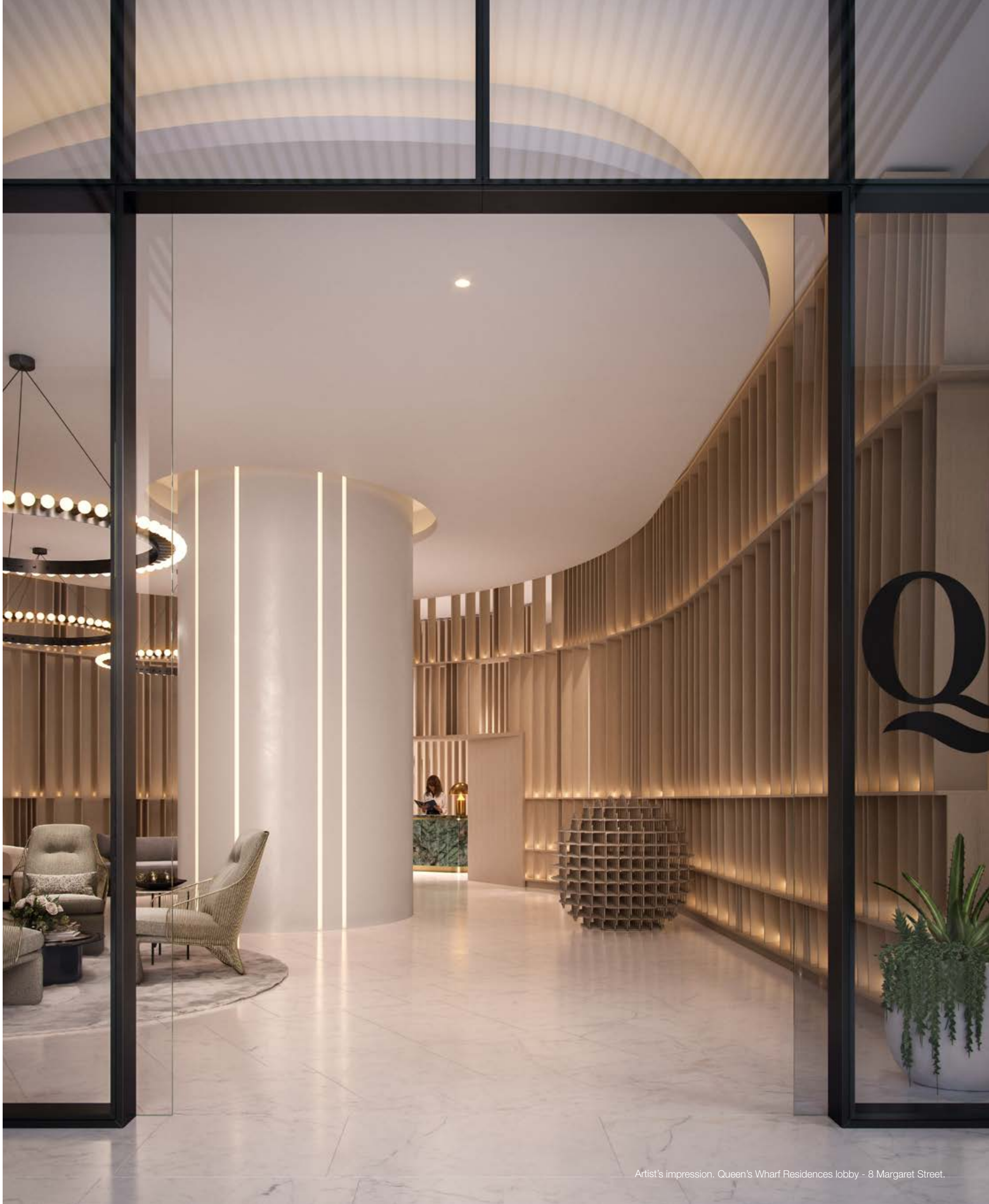
Artist's impression. Queen's Wharf Residences lobby - 8 Margaret Street.

Queen's Wharf Residences is currently the largest residential project in Queensland that is targeting a 6 Green Star Design & As Built rating. It will truly redefine life in Brisbane, and this is a rare opportunity to be part of history in the making.