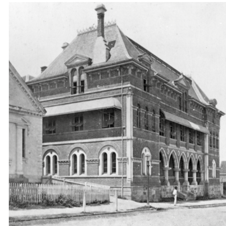
Brisbane Printing Office.

Artist's impression. Miller Park between William Street and Queen's Wharf Road.