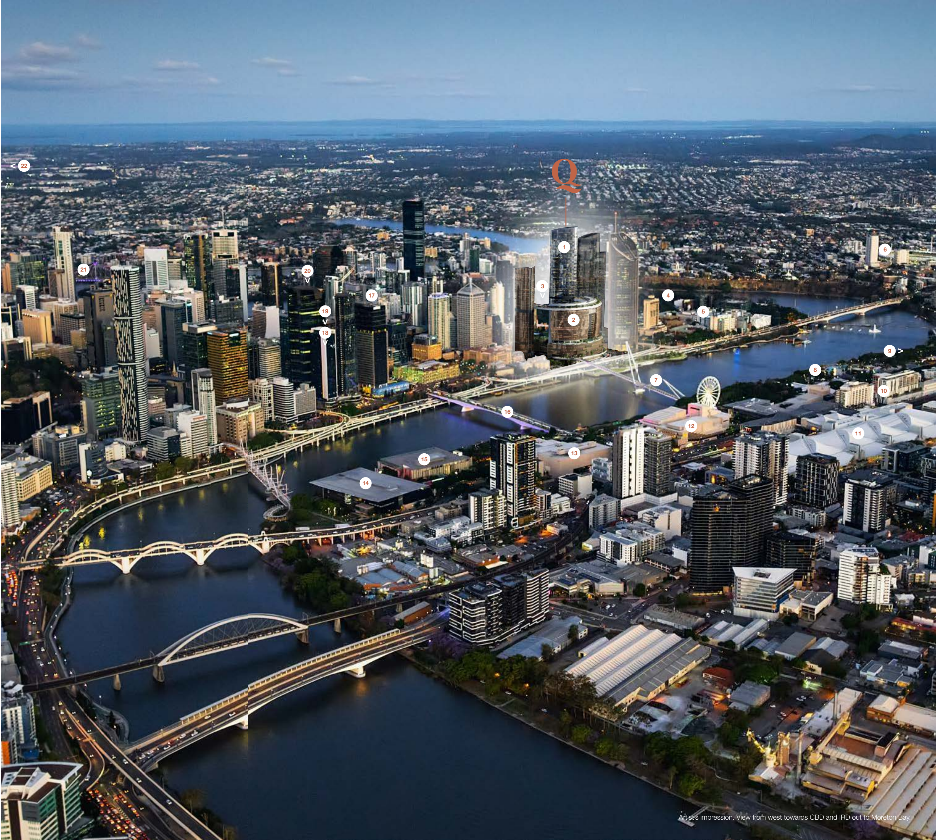
Artist's impression. View from west towards CBD and IRD out to Moreton Bay.