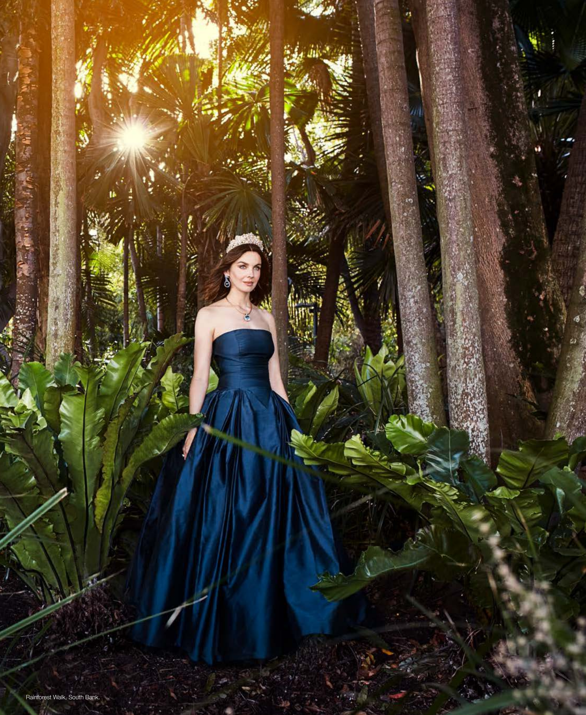
Rainforest Walk, South Bank.