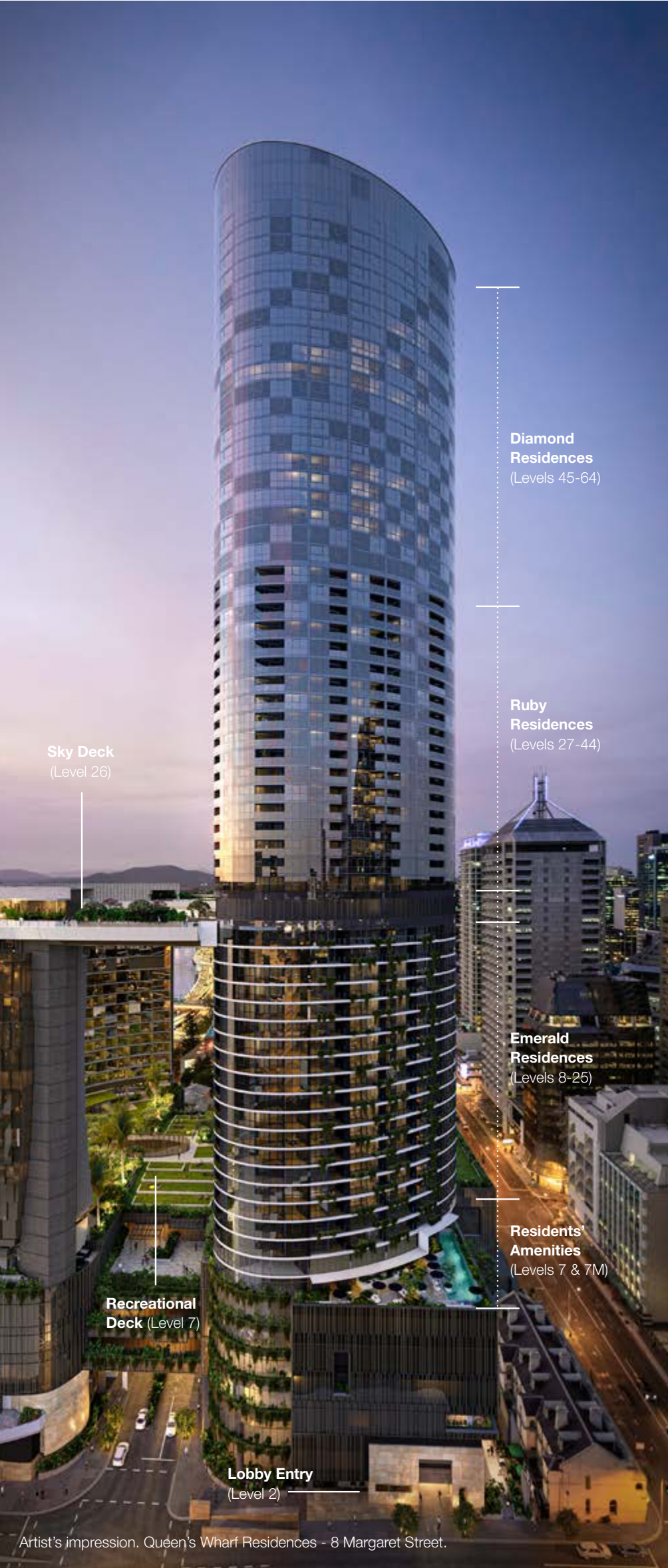
Artist's impression. Queen's Wharf Residences - 8 Margaret Street.