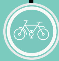
'Greenway' cycle path 8-minute cycle