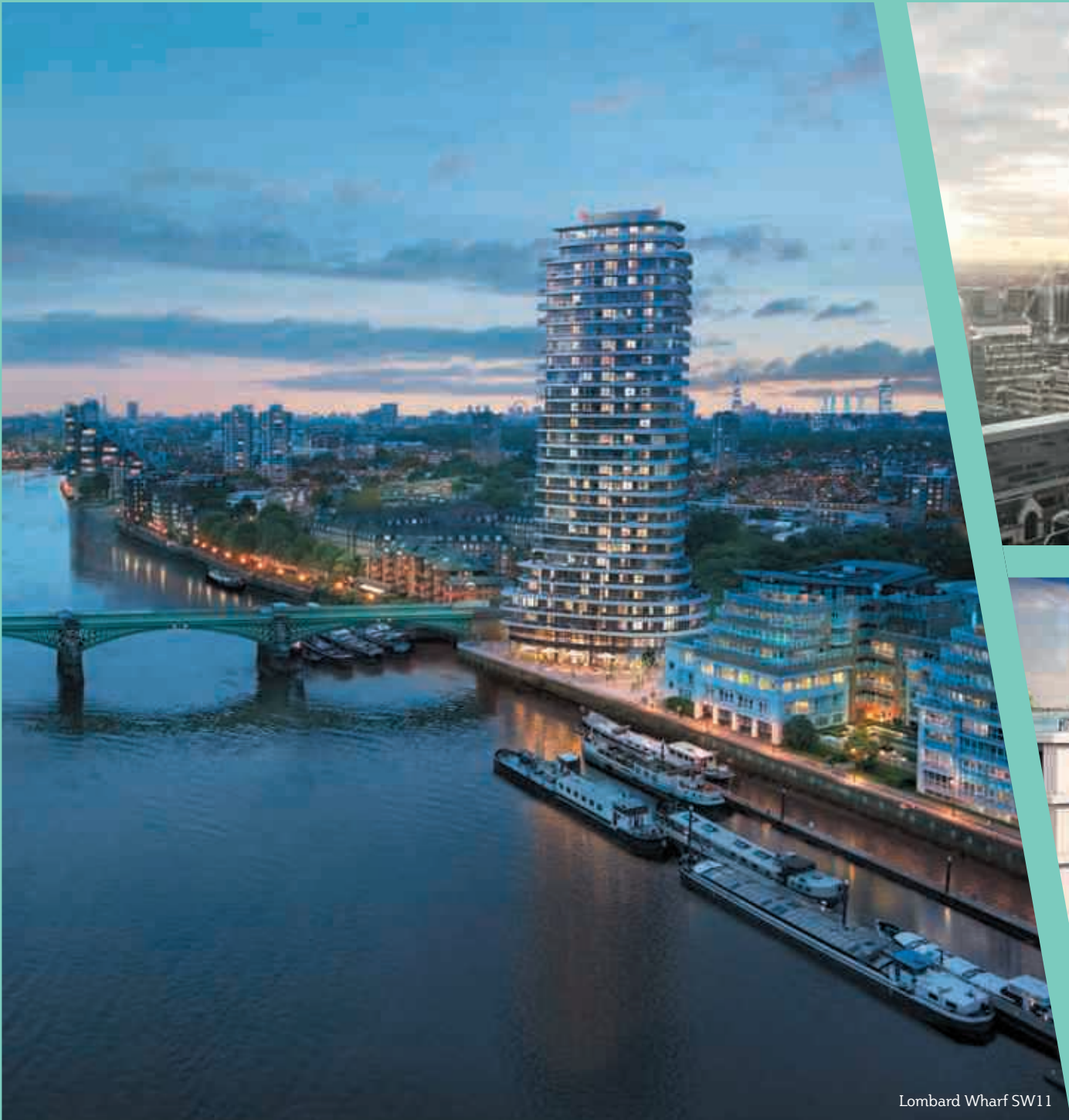
Lombard Wharf SW11

*We are the only major national housebuilder to be awarded this award 10 years running. “we” refers to the Barratt Developments PLC group brands including Barratt London, Barratt Homes and David Wilson Homes.