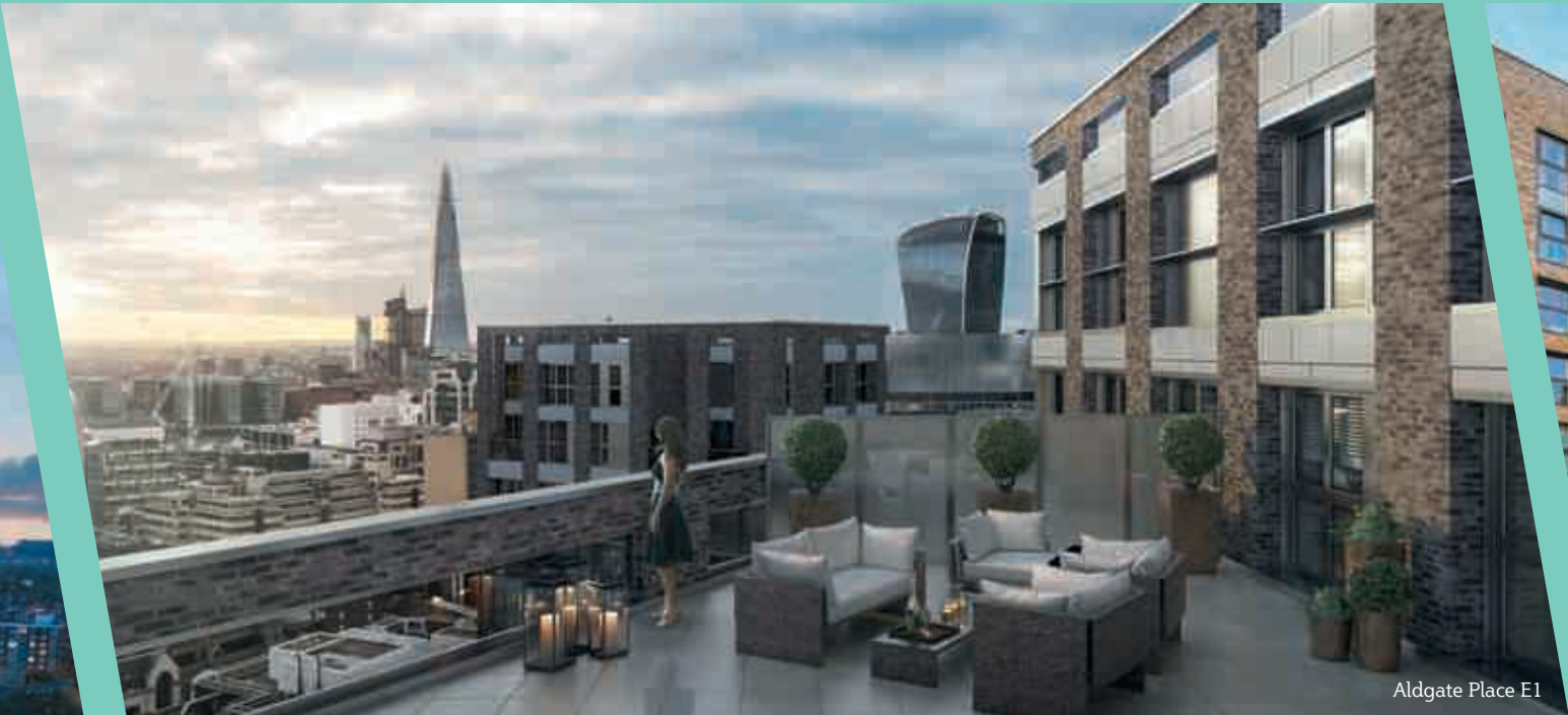
Aldgate Place E1