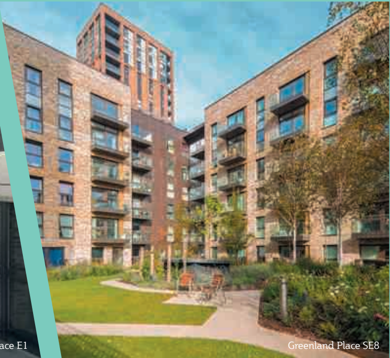
Greenland Place SE8