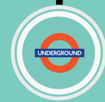
London City Airport 33-minute Tube