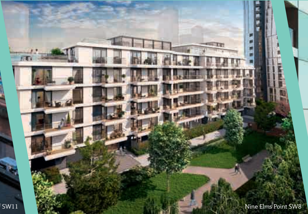
Nine Elms Point SW8