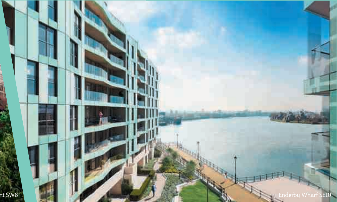
Enderby Wharf SE10